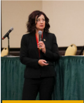
STATE LAW ENFORCEMENT