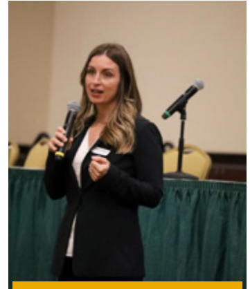
TAT & NONPROFITS