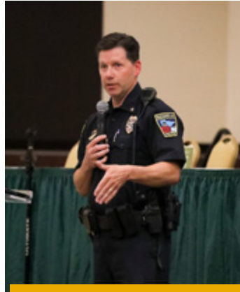
LOCAL LAW ENFORCEMENT